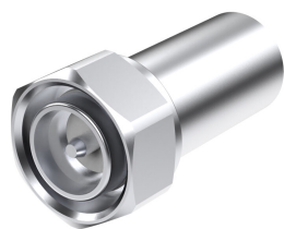
Type 4.3-10 Male connector for CNT-400 braided cable