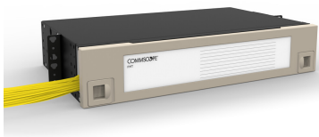
FMT Fiber Termination Panel, with sliding tray, 72 SC/UPC, singlemode, 2RU, 19 in, putty white