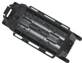
MST, Fiber Optic Universal Mounting Bracket, 2/4 port