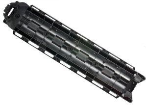
DLX® MST, Fiber Optic Universal Mounting Bracket, 12 port