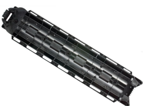
DLX® MST, Fiber Optic Universal Mounting Bracket, 12 port