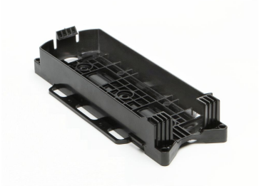
DLX® Mini-MST, Fiber Optic Universal Mounting Bracket