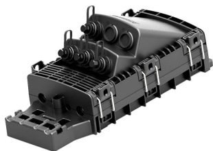
Mini-OTE 200-Series, Optical Terminal Enclosure, 4-port full-size connector, 1:4 splitter, black, wall mount