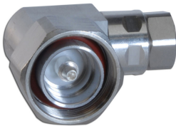
7-16 DIN Male Right Angle for 1/2 in FSJ4-50B cable