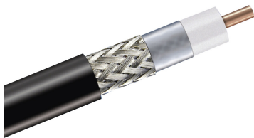
CNT-400, CNT® 50 Ohm Braided Coaxial Cable, variable, black PE jacket