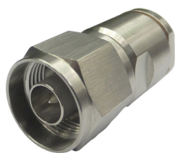
Type N Male for CNT-400 braided cable