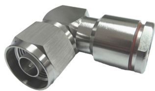
Type N Male Right Angle for CNT-400 braided cable