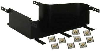
FiberGuide® Left Reducer, 4x24 to 4x12in, Black