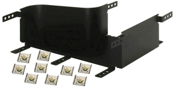
FiberGuide® Right Reducer, 4x24 to 4x12in, Black