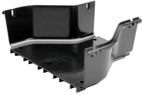
FiberGuide® Straight Reducer, 4x12 to 4x6in, Black