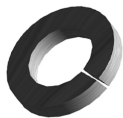
Galvanized Lock Washer, 5/8 in