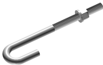
J-bolt Kit, 8 in