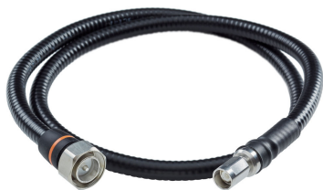
LSF2-50 SureFlex® Jumper with interface types NEX10 Male and 7/16DIN Male, 3m