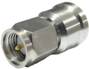
SMA Male for 1/4 in foam and air coaxial cable, factory attached