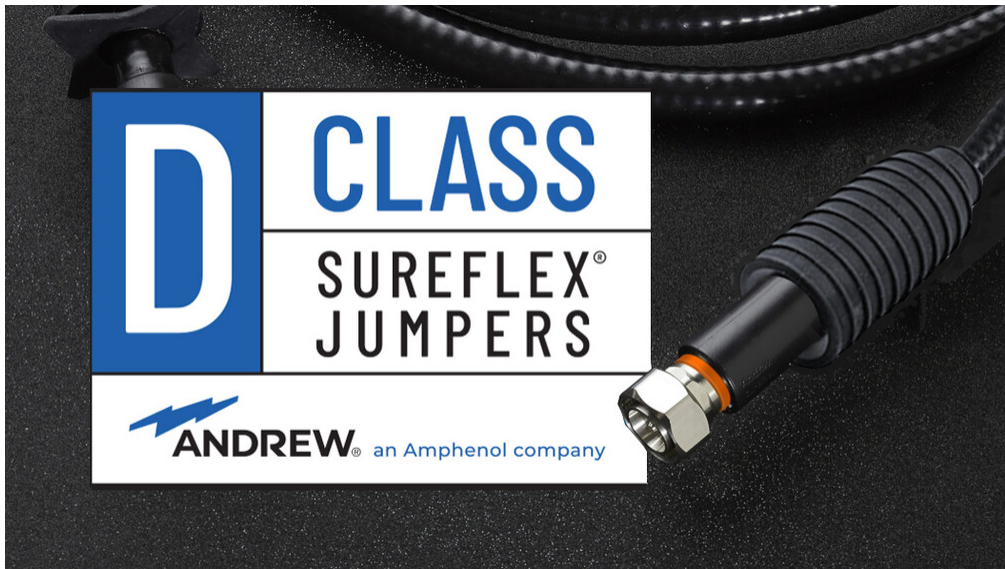
Jumper Assembly Sample Label