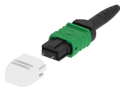
MPO-12, ULTRA LOW LOSS, MALE, Singlemode, GREEN, 2mm