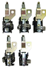
Mini-OTE 300-Series, Optical Terminal Pole Cable Retention Kit