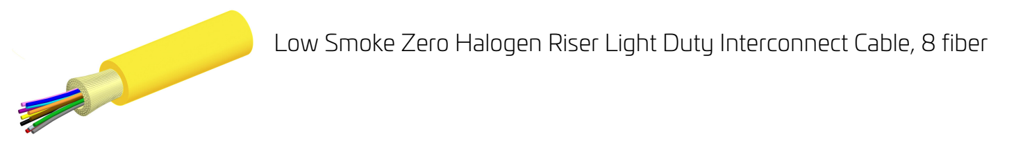
Low Smoke Zero Halogen Riser Light Duty Interconnect Cable, 8 fiber