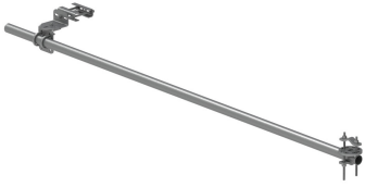
Stiff Arm / Tieback Bracket, includes 150" pipe