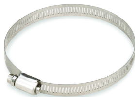
Round Member Adapter for 2–3 in round members