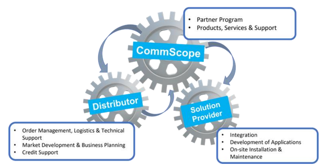
Figure 1 - Roles and Responsibilities of Solution Provider Channel Members and Distributors.

The Partner Program is comprehensive in nature and is dedicated to Channel Members. Figure 1 highlights the roles and responsibilities of Channel Members.